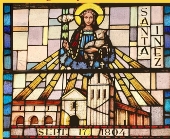
Image from Mission Dolores Basilica, San Francisco, CA

Tuesday, September 17 Bilingual Mass - 6:30 p.m Followed by Celebration in Parish Hall Refreshments, Music, Amigos Marketplace