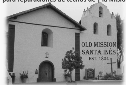
Ganancias recaudadas y preservación y mantenimiento para esta Misión Histórica de California